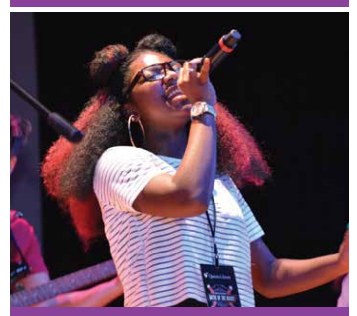
10 Congratulations to the Battle of the Bands Winners!