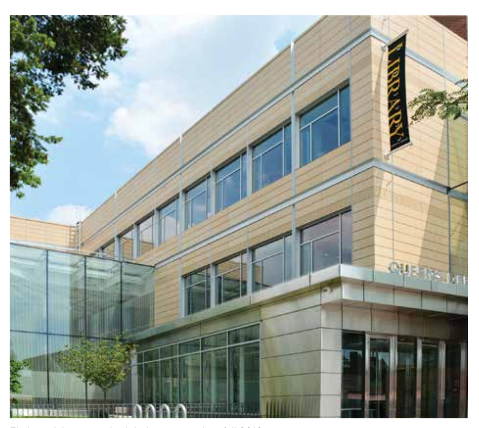
Elmhurst Library is scheduled to open in late fall 2016.

JBA is also offering 1-on-1 Job Readiness Services in English and Spanish at Corona Community Library , Wednesdays from 10 a.m. to 6:00 p.m. These services include creating and