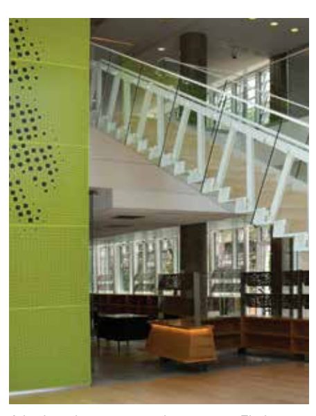
A look at the unique architecture at Elmhurst Library.

offering several walk-in sites for adults to practice their English conversational skills while learning about important New York City resources. To find an English Conversation group at a library near you, please visit queenslibrary. org/practice-english.